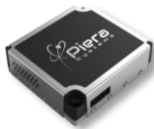
1. IPS-7100 Sensor